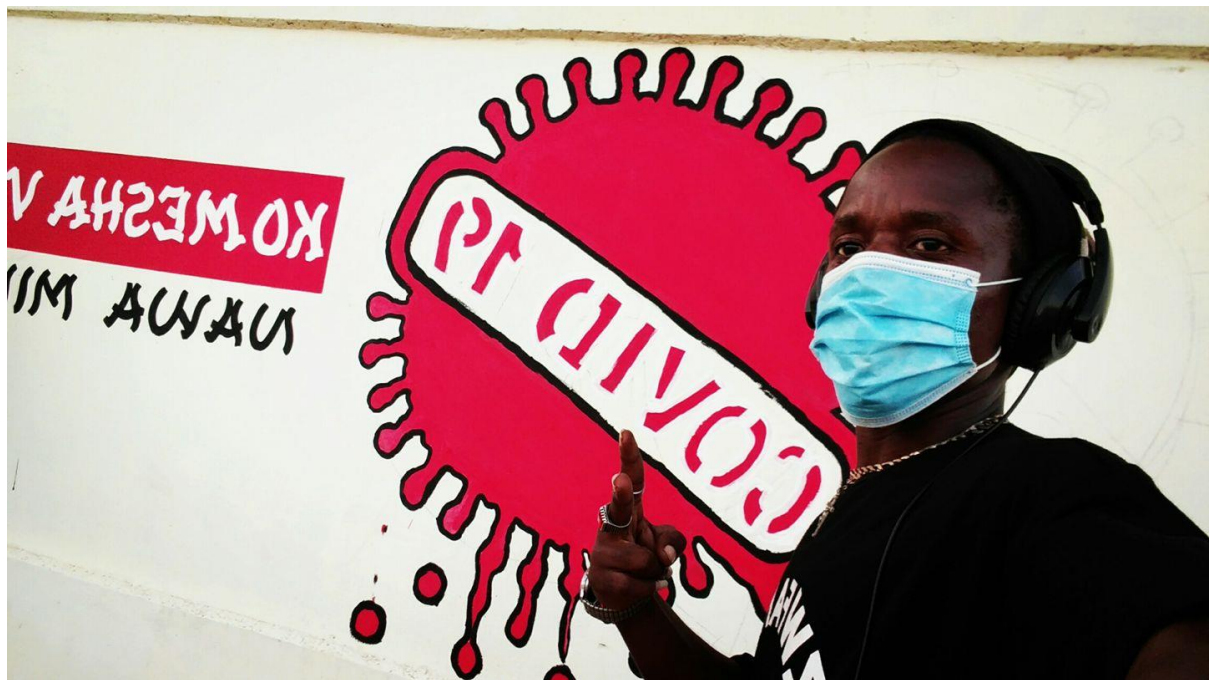
Murals art works around lodwar town